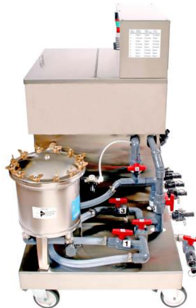
Portable Unit With Locking Wheels