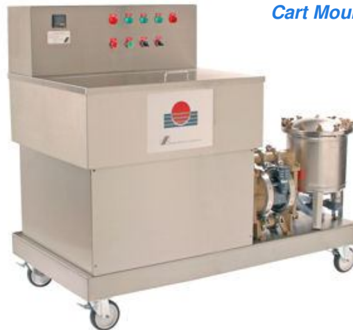
Cart Mounted Tank

2115 Northwestern Ave Waukegan, IL 60087 Phone 847-244-3600 Fax 847-244-2860 www.amerikal.com