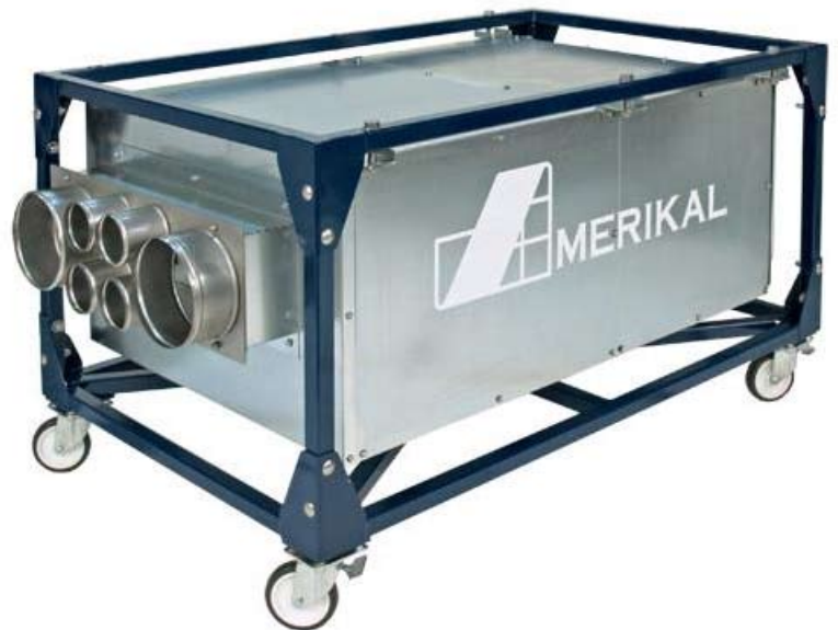
Optional Portable Mounting Rack