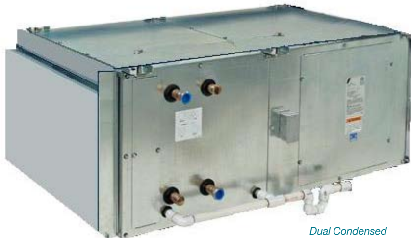
Dual Condensed Drain Connections