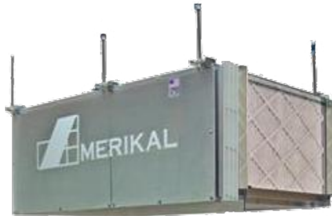
Six Point Ceiling Mount

Or Winter Facility Humidification Package